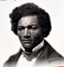
Douglass was inspired by white abolitionist William Lloyd Garrison, who published his ideas in a newspaper called The Liberator .

One of the most prominent abolitionists was Frederick Douglass. Douglass was enslaved in Maryland until he escaped in 1838 by disguising himself as a sailor and traveling to New York City. Describing his life as a free man, Douglass later said, "I lived more in one day than in a year of my slave life." Douglass moved to New Bedford, Massachusetts, where he became a preacher. He also began to attend abolitionist meetings and was invited to describe his own experiences. He was a commanding speaker, known for his powerful language that opened his audience's eyes to the cruelty of slavery.